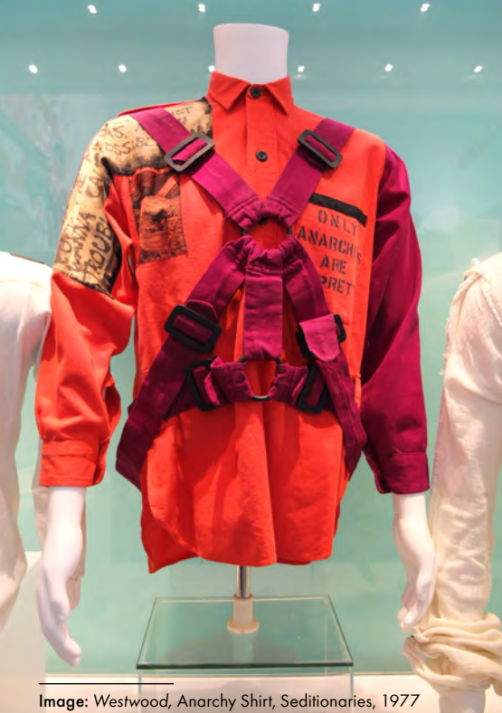
Image: Westwood, Anarchy Shirt, Seditonaries, 1977