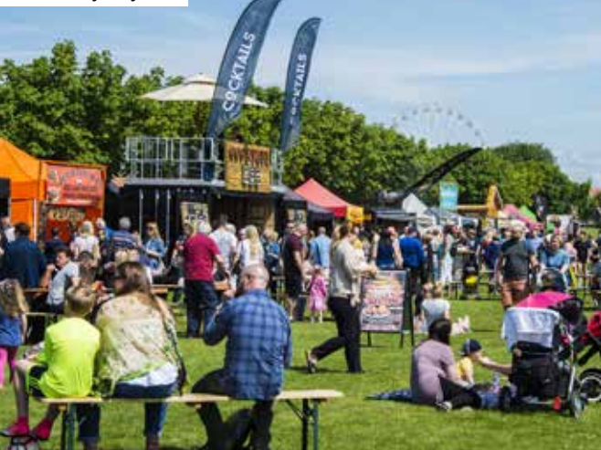
Fun Family Day Out