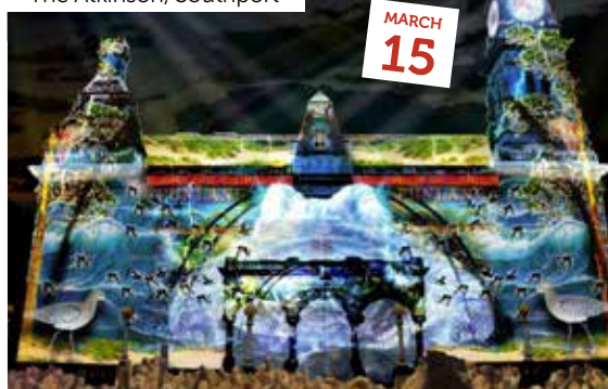
The Atkinson, Southport