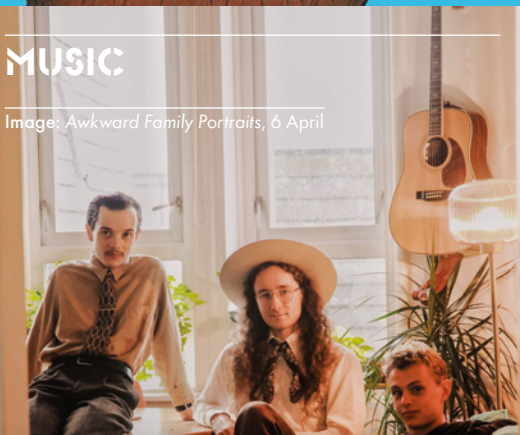
6 April