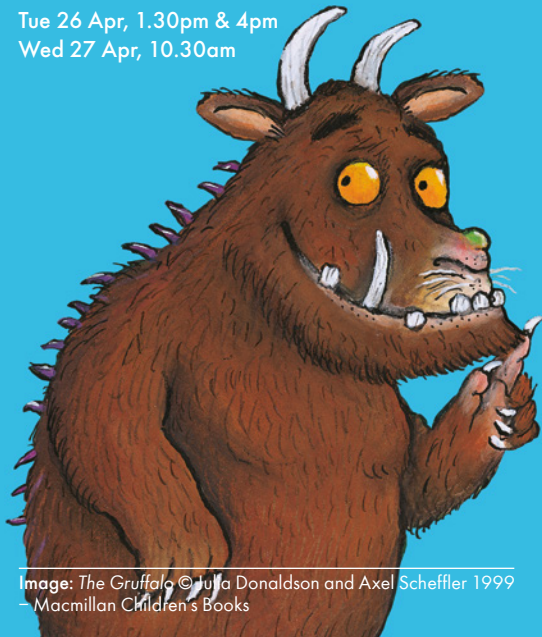
Image: The Gruffalo