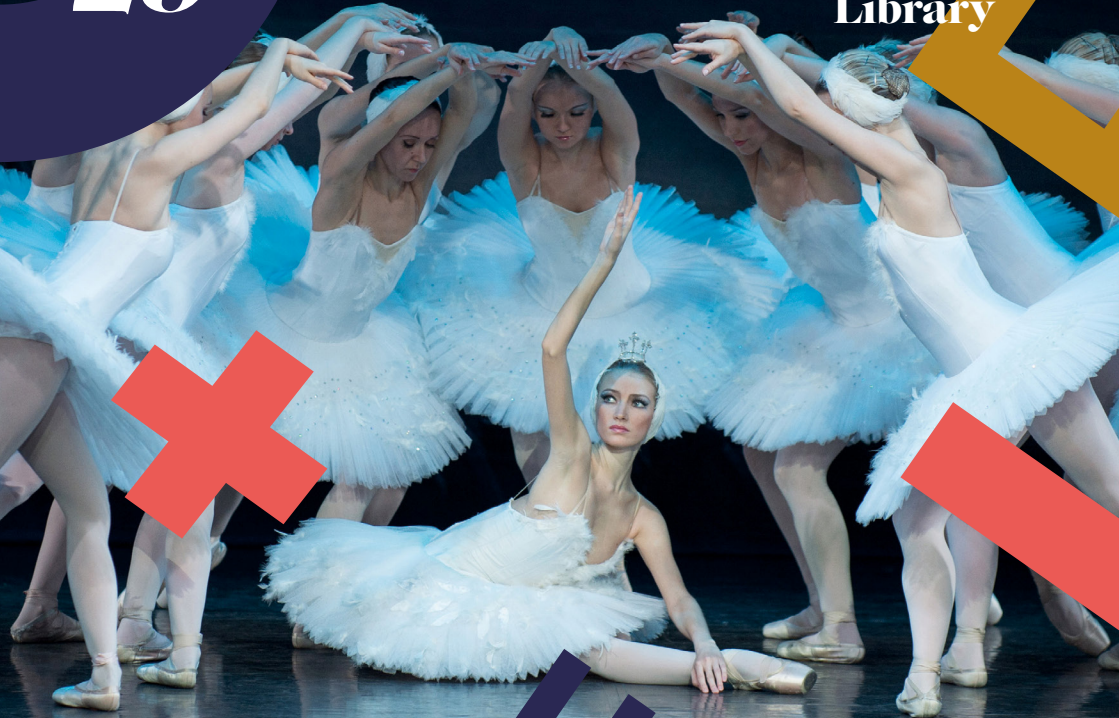
Image: Crown Ballet, Swan Lake, 3 Oct 2023

Music Theatre Comedy Exhibitions Museum Shop Café Library